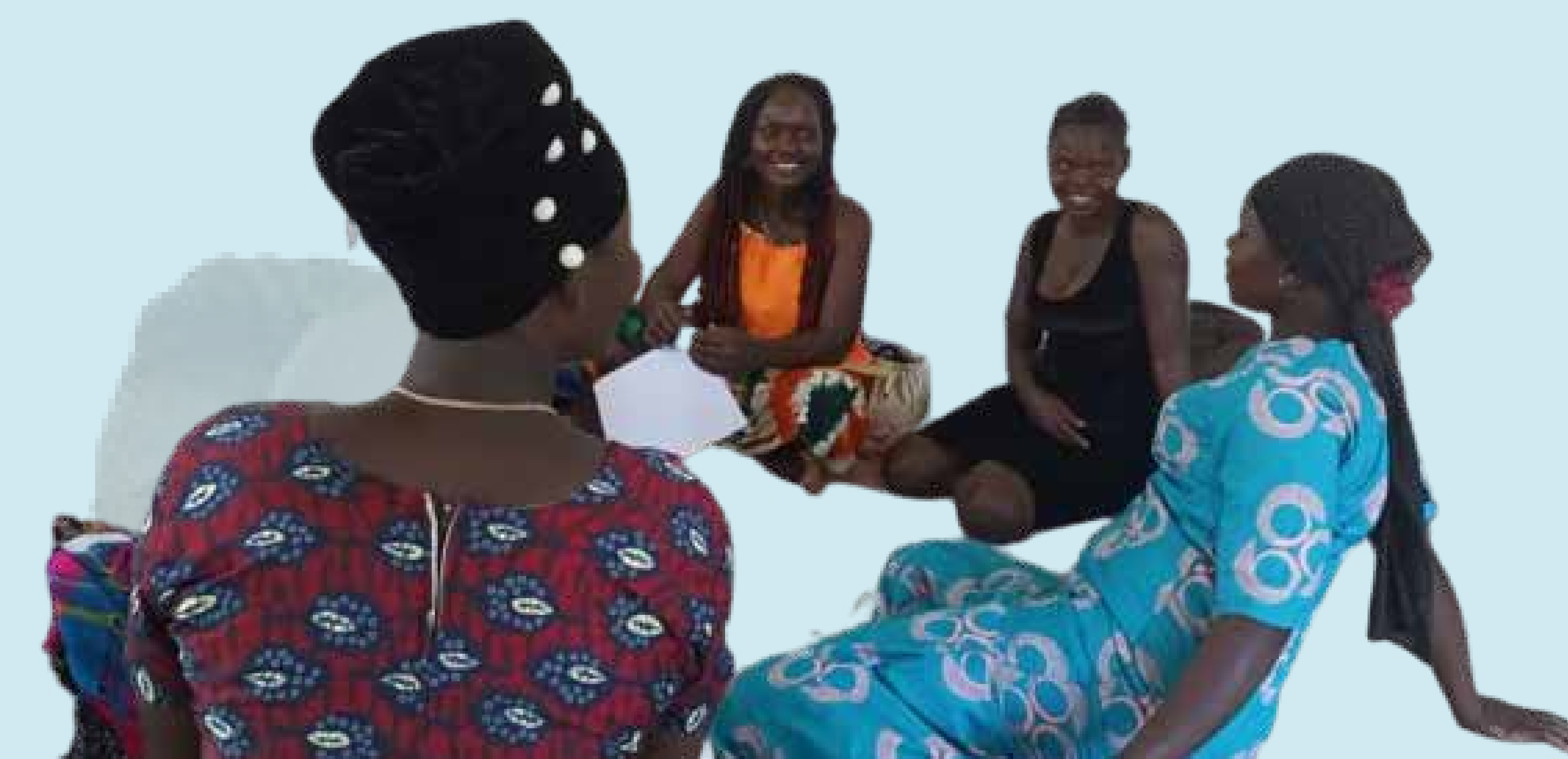
NUMBER ENGAGED DURING PROJECT IMPLEMENTATION 2022